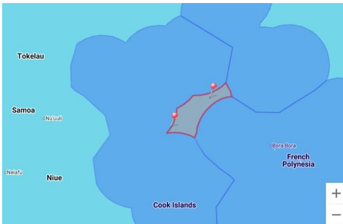
Figure 1: A sample screen shot of the “live list” on the WCPFC website.